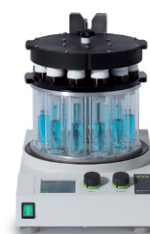
Multivapor™ P-6 / P-12 Efficient evaporation for multiple samples