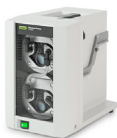
Vacuum Pump V-300 The economical and silent vacuum source